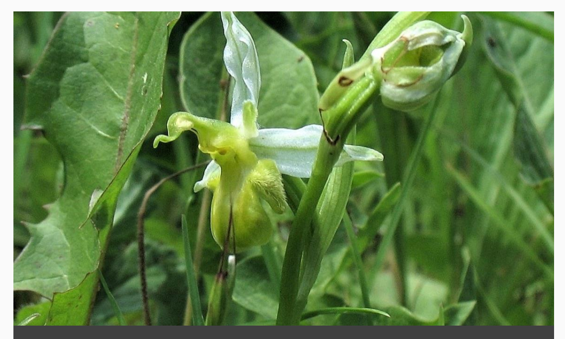
A Bee Orchid in Brundish.

Originally called the 'humble bee orchid', this species was given its name because the flowers mimic a female bee, both in scent and appearance - the male bee is tricked into landing on the flower and attempting to mate with it!