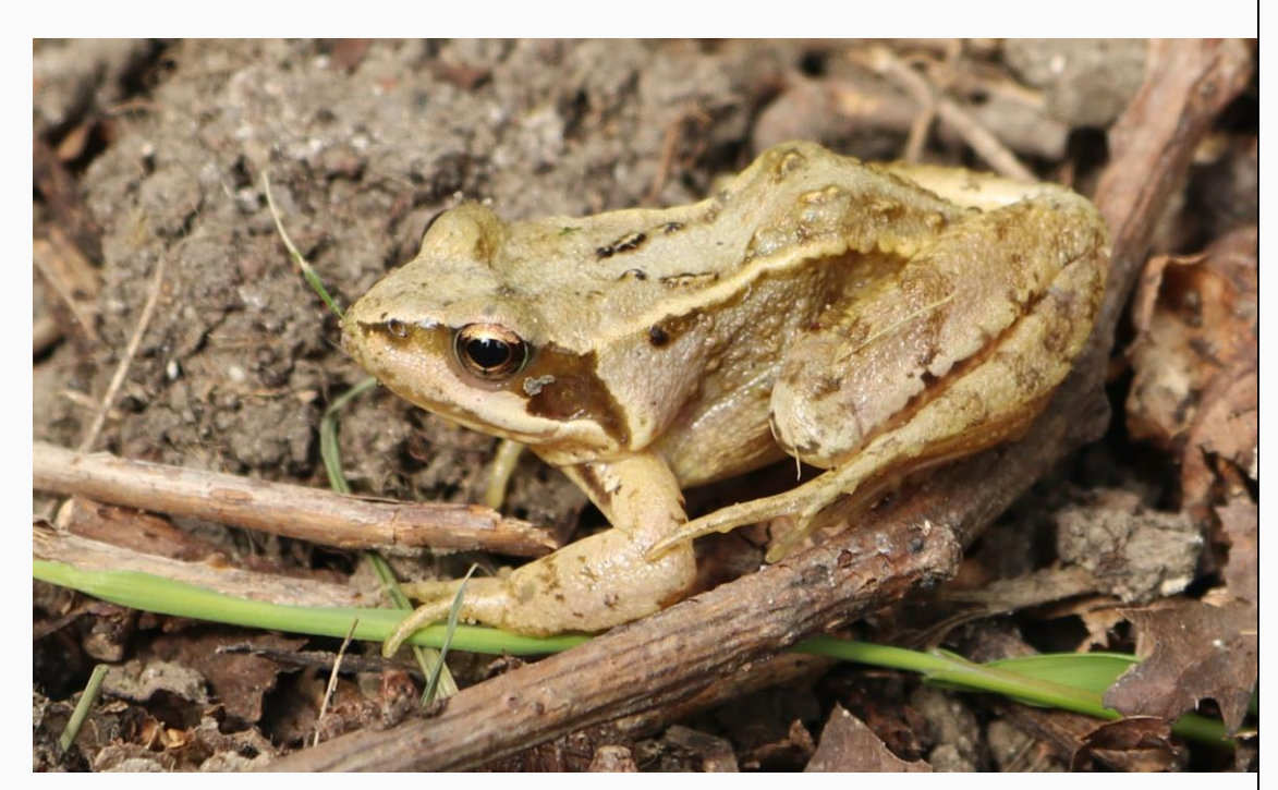
Spotted in our garden earlier in the year - can anyone help identify what species it is..?