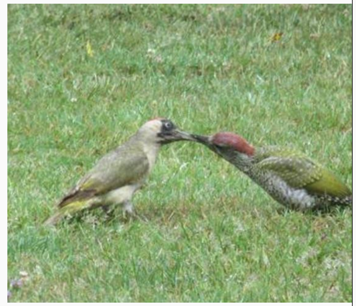
Green Woodpecker with youngster - Photo courtesy of Lyn Edwards